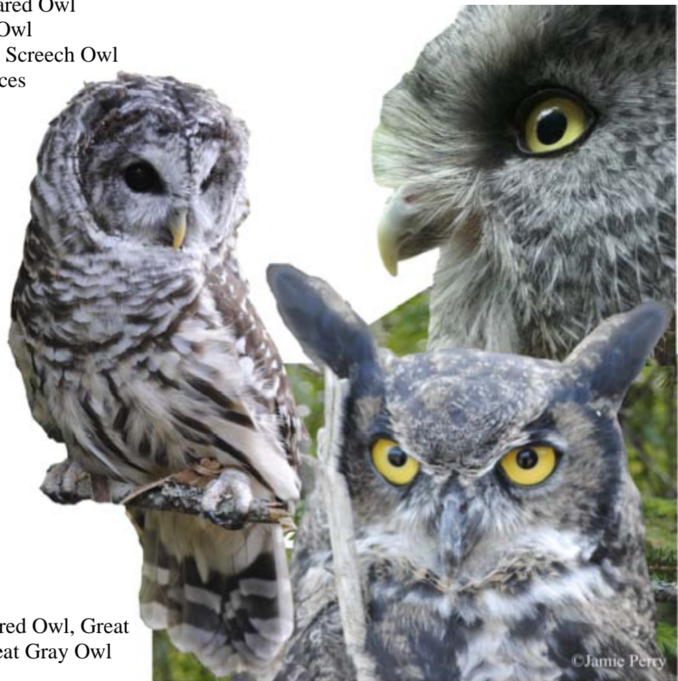
Pictured on right Barred Owl, Great Horned Owl, and Great Gray Owl