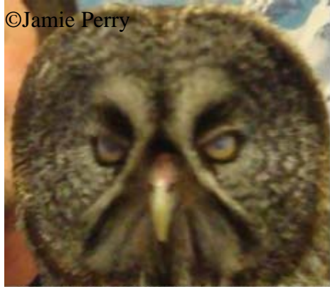
Great Gray Owl with Nictitating Membrane

Owls see in limited color or in monochrome. This is beneficial for owls though, because they are typically night hunters and have astounding night vision. Some